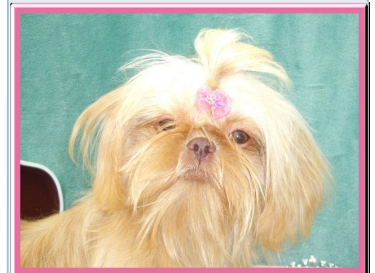
Emmy from Double Diamond Imperial Shih Tzu and Marcia Hedrick

At five weeks obedience training can begin in a totally positive fashion. Give five minute sessions on sit, stand, down and leash training. Use a plain buckle collar and do not pull or jerk the leash. Introduce the pups to the outdoors. This is a good time for them to meet new adults and children. Continued on page 6.