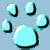
Photo Contest Winner

Puppy love is the beginning of a lifetime affair for most dog owners.