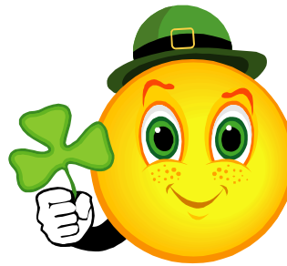
Happy St. Patrick's Day

As St. Patrick's Day rolls around have fun with your dog and dress your dog in green and maybe even dress in a matching outfit.