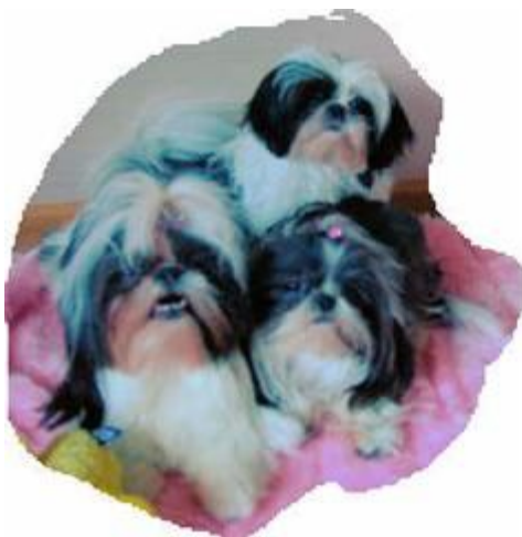
Beautiful Bella, Lilo and Lola from Nancy Ahlquist. Cute little black and white puppies just taking it easy reading the ISIS website.